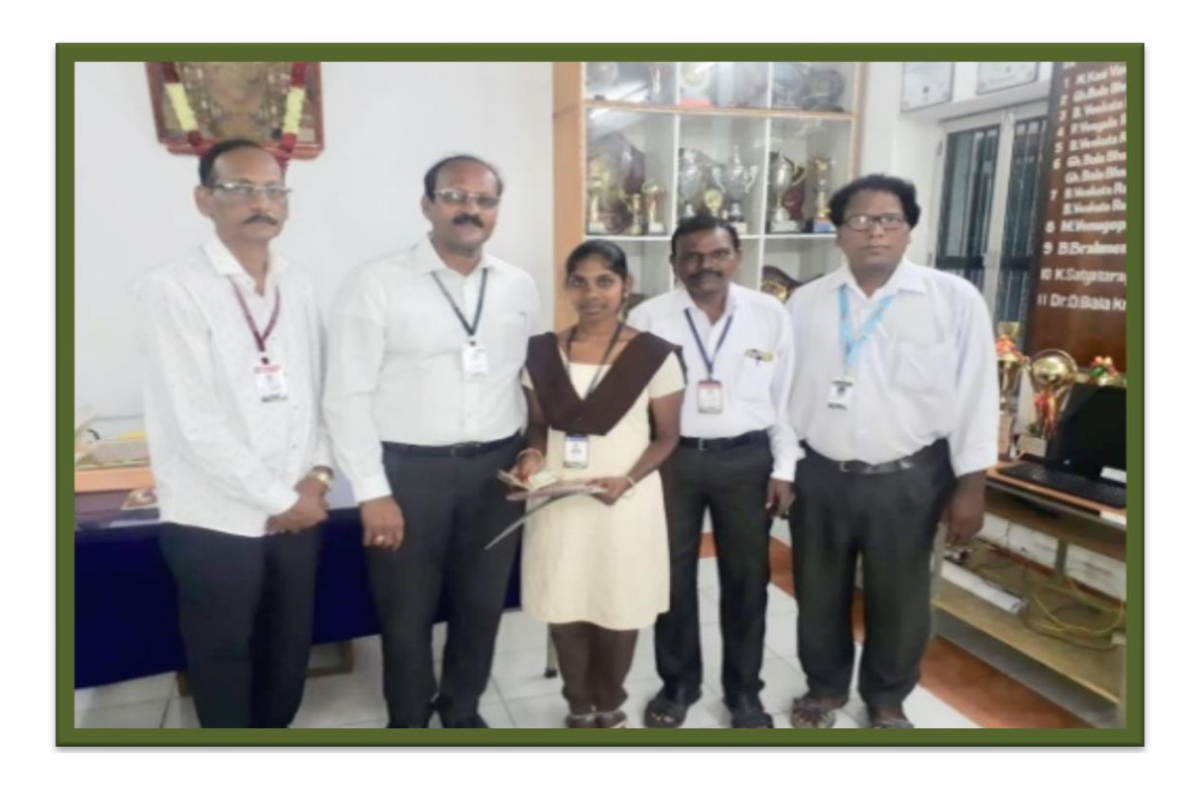
K.V.R & M.V.R COLLEGE – ESSAY WRITING ( CASH PRIZE)